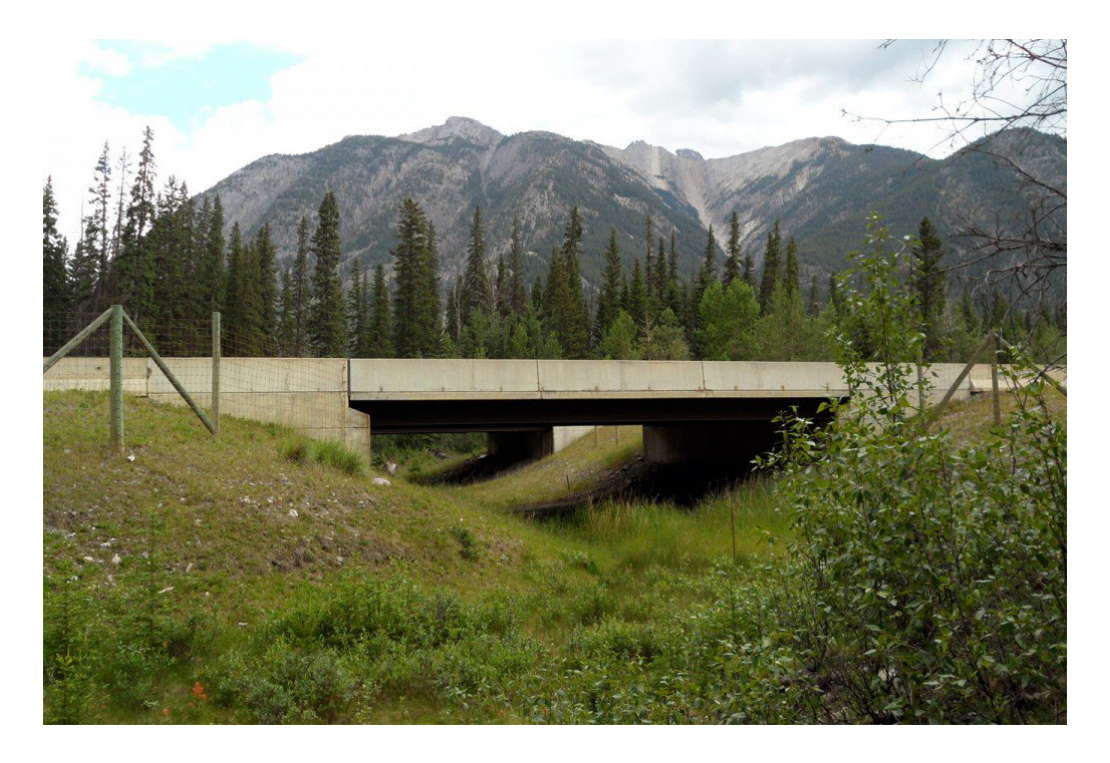
Wildlife crossing, Banff, Canada.

Several European countries — notably France, the Netherlands, Switzerland and Germany — mandate an intensive highway design process that integrates environmental factors in the earliest phases of project design and makes extensive use of wildlife crossings and other ecological mitigation infrastructure. The scope of this investment manifests in large-scale systems like the 108 water treatment basins lining France's new "eco-motorway" and the nine ecoducts (Europe's equivalent to wildlife overpasses) currently under construction in the Netherlands as part of a national landscape connectivity initiative working towards the creation of a National Ecological Network.