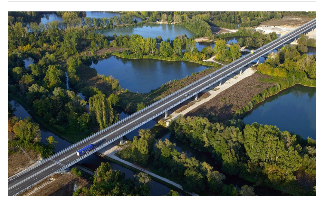
The Loing Viaduct, France.

High-speed rail may get the flashy headlines, but most U.S. transportation dollars go to building, widening and maintaining roads. President Obama's 2012 budget proposal called for substantially increased spending on rail and public transit, but nonetheless allocates 55 percent of transportation funds to the Federal Highway Administration. <sup>1</sup> The United States adds 32,000 lane miles annually to the 4 million miles of public roads already crisscrossing the country. <sup>2</sup> For more than a century, we have allowed expressways, arterials and rural roads to define our landscapes without seriously considering how we might redefine the road. Engineers have rarely attempted to incorporate ecological functions, let alone artistry, into a design practice historically dominated by concerns for speed and efficiency.